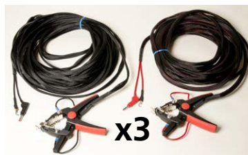
Sets of test leads (x3) 20 m (65 ft)