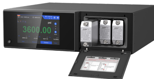
Additel 783 with ADT151 Pressure Modules